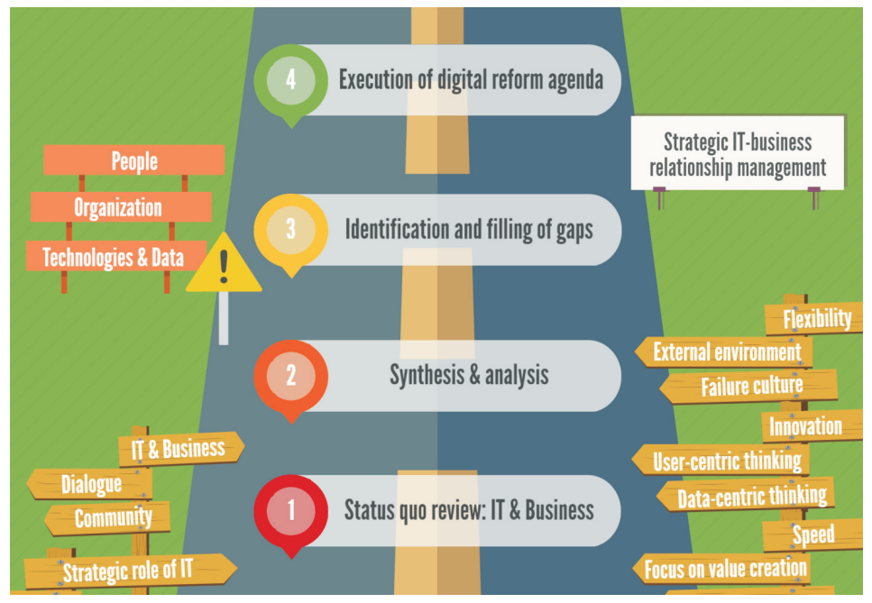
Fig. 3. Digital transformation roadmap

positive impact on employees' capabilities. Business and IT will start speaking a common language, which will make it easier to collaborate on future projects. By working hand in hand with business will strengthen the intrinsic motivation of IT members as they will start seeing business challenges as their own. In other words, they will not see problems as solely business or IT problems, but as our problems. Through supporting each other, the teams will start to trust each other. By gaining visibility and prestige, as well as by spreading success stories (Sweetwood, 2016, p. 132) IT's perception will automatically shift to the position of innovation-partner. Thanks to interdisciplinary teams and breaking down of know-how, organizational as well as technical silos, a shift is to be observed from IQ to WeQ<sup>3</sup>, which is synergy-driven intelligence of a team as a whole, where the sum of separated IQs is lower than the WeQ of a team consisting of the same people. This phenomenon can be also described as a network effect or ROC, return on collaboration (Frost & Sullivan, 2016, pp. 6-7, 12). Solid IT-business relationship will lead to a lower percentage of uncontrolled shadow IT, resulting in a higher ROI of technology investments. Maintenance of available solutions and portfolio management will become easier and resources which have been duplicated in the past will be reduced.